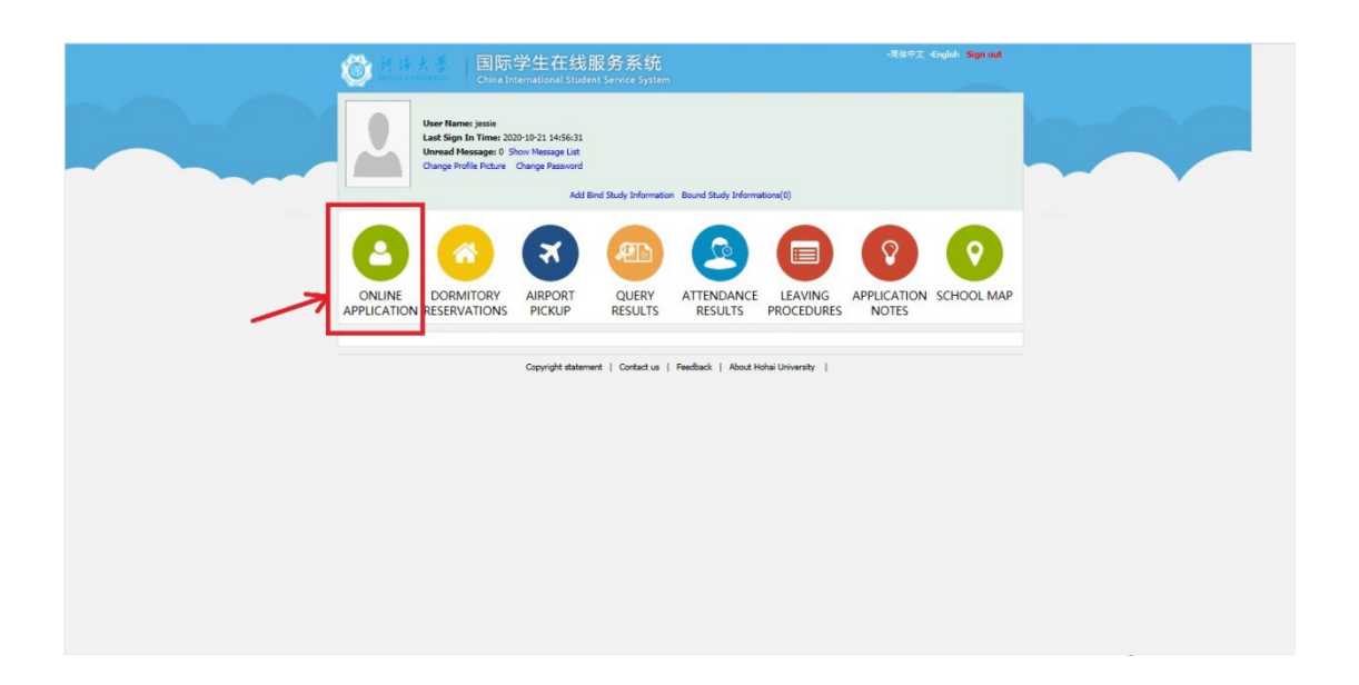
Step 2. Choose "Inter-school exchange" portal.

Step 1. Sign in the system with your own user name and password and start the online application.